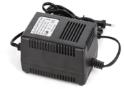
AC24V/3A Power Adapter